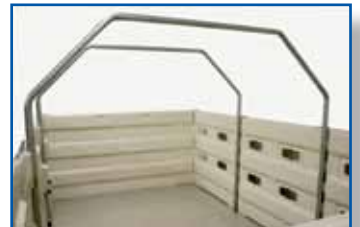
Convert to group housing