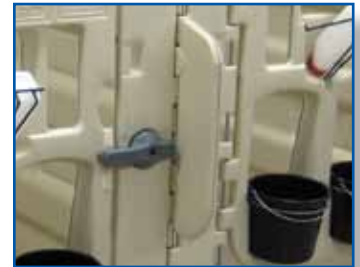
Rugged pen divider