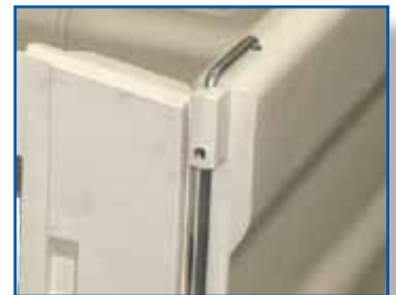
Solid steel hardware