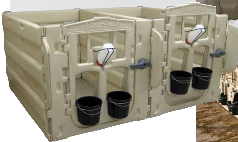
Adjustable door and bucket height Rugged pen dividers