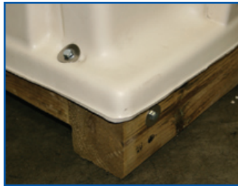
Treated Lumber Base

Calf-Tel housing systems are the most economic and efficient available. Our systems will help you decrease labor, treatment and veterinarian costs.