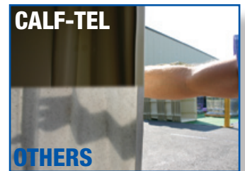
Totally Opaque Material Blocks the sun's UV rays providing cooler temperatures.