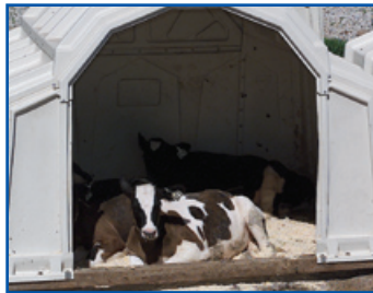
Large Entry Way