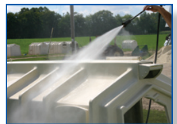
Bio-security Constructed of microbial-resistant materials, which means healthier calves.