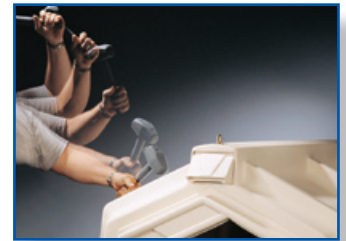
High Molecular Weight Polyethylene Extended life and durability - won't cold crack or break.

At Hampel Corp., our products are built to last. We proudly stand behind our craftsmanship. Contact us for the complete details.